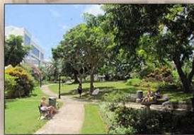
Queen Elizabeth Park

WEDNESDAYS 10:30AM - 12:00PM & 1:30 pm - 3:00pm $30 per person including souvenir