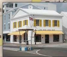
Irish Linen Shop